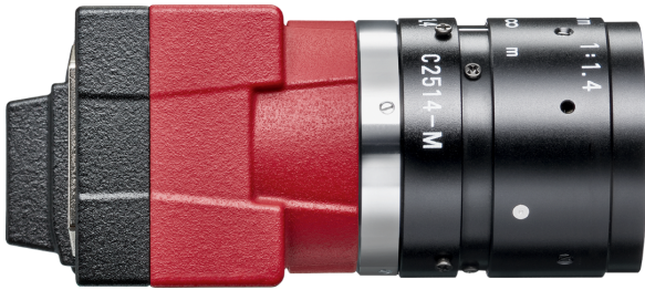
Model without hardware options