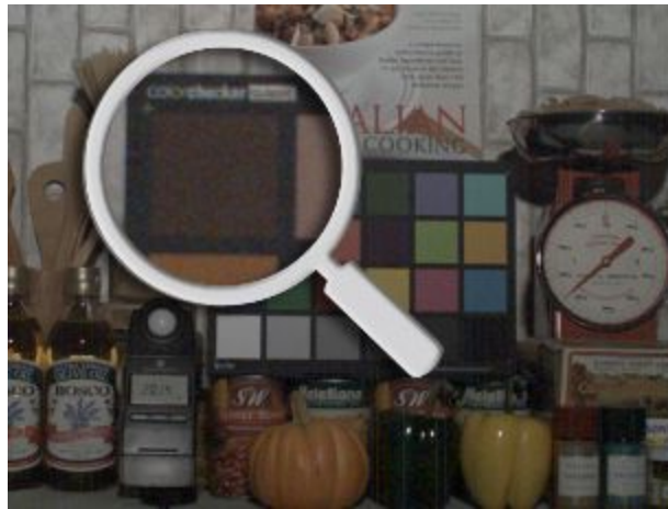
Competing product A

(4.8 \mu\text{m} pixels approx. 1.31M effective pixels)