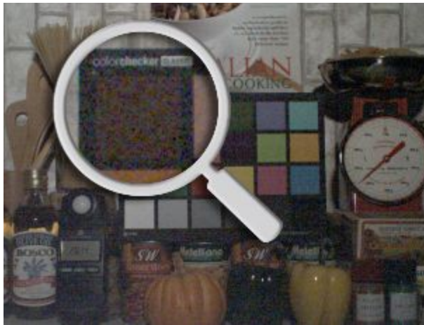
Competing product B

(4.5 \mu m pixels approx. 1.92M effective pixels)